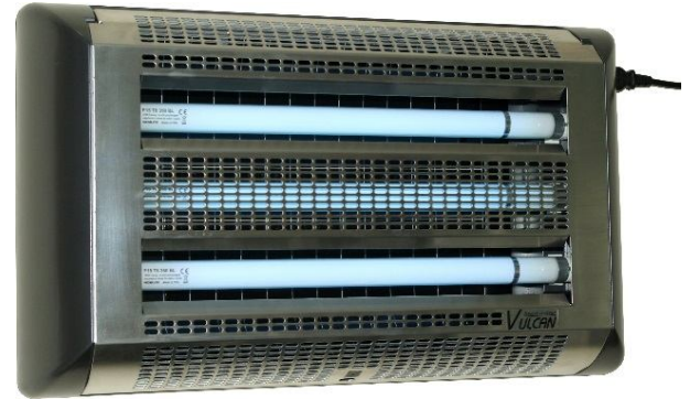
Actual size W 59 x H 35 x D 10.5 cm

An IP65 version is also available. All machines are fitted with high output Quantum lamps.