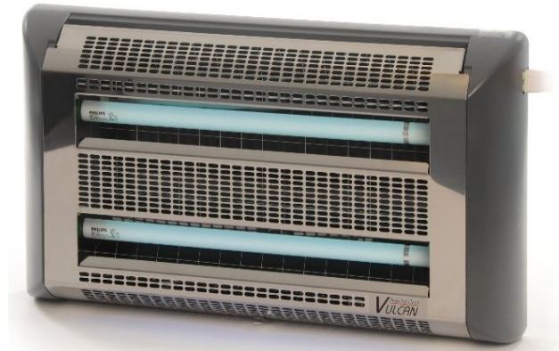
Actual size W 59 x H 35 x D 10.5 cm

An IP65 version is also available. All machines are fitted with high output Quantum lamps.